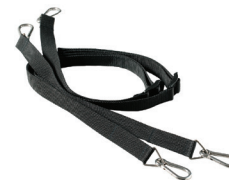
1.05.116: GUTTER STRAP