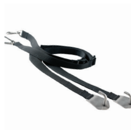
1.05.112: WET DECK STRAP